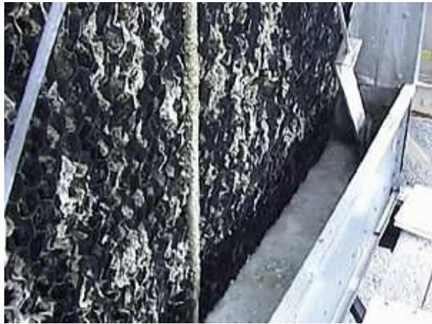
This photo shows serious maintenance neglect. Tower has high organic content and heavy scaling. This tower is a health and safety hazard.

"What is the needed ratio of water treatment chemicals to that of debris load inside the cooling tower to ensure cooling tower safety?" Although the question is obvious, the answer isn't. Organic debris is drawn into cooling towers in different concentrations depending upon location and time of year. Every type of debris places a different demand upon the biocides and scale inhibitors being dosed into the water; therefore, there is no known ratio that will hold constant for every cooling tower. However, it is safe to say that if you don't deploy diligent maintenance procedures that specifically call for the prevention of organic debris from getting into the cooling tower or its periodic removal, more water treatment