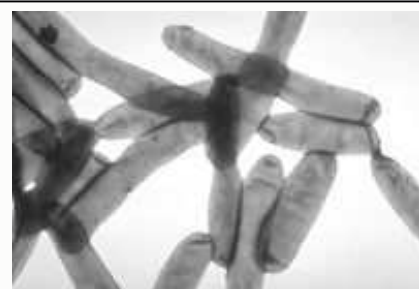
Legionella as found in cooling towers and boiler systems

unsatisfactory results. Conversely, if the intervals between maintenance are too long, it may be more cost effective, but the condition of the cooling tower at each interval may be less than desirable and potentially place maintenance workers, employees, tenants and the public at risk. So the answer largely lies somewhere in the middle where water treatment and managing debris